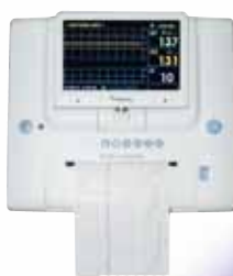
Wall mount style